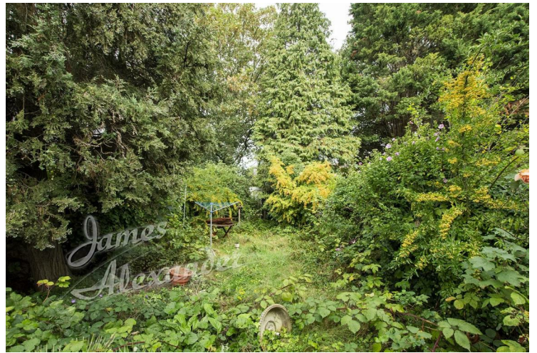
Garden 45'11" x 19'4" (14 x 5.90)