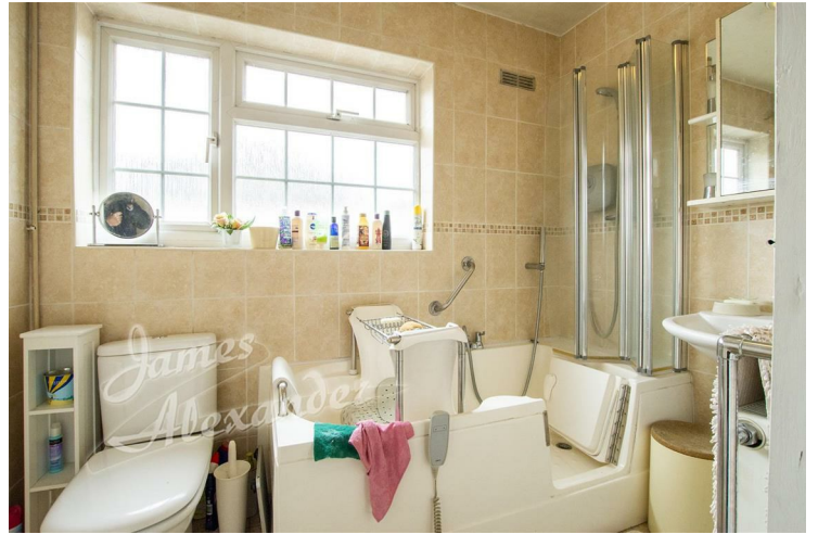
Bathroom 8'2" x 4'11" (2.50 x 1.50)