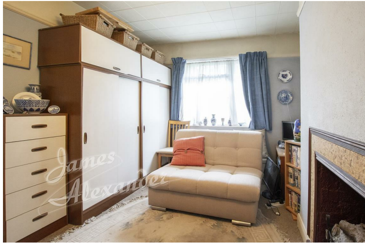
Bedroom 2 13'5" x 9'6" (4.10 x 2.90)