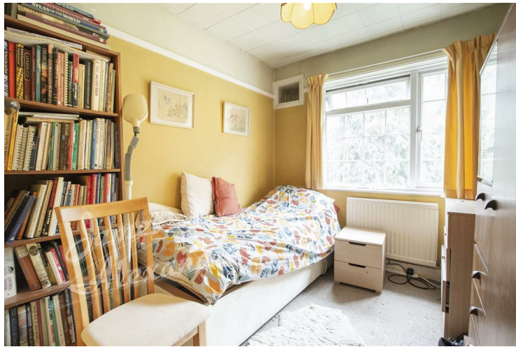
Bedroom 3 10'9" x 8'2" (3.30 x 2.50)